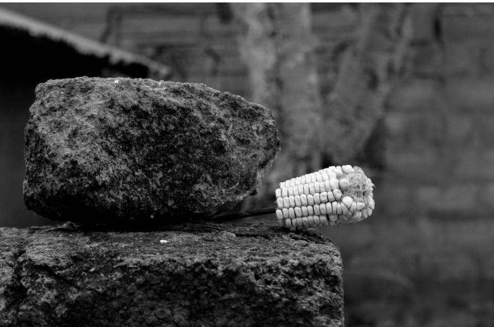
↑ Figure 1. Vodou shrine sculpture installation (2017). Brékété shrine, Dansoman, Accra