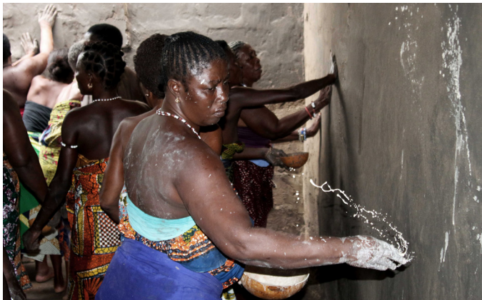
Figure 1.6. The next stage of the creative process is exclusive to a single artist (known as the Xanukplɔ ) for each of the satellite Kli-Adzima shrines. Mama Vena shrine Xanukplɔ , engaged in the process of dripping, splashing, and sprinkling abstract expressions on the plastered shrine wall (2016). Klikor, Volta Region