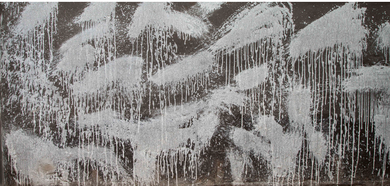
Figure 1.8. A finished balili mural (2016). Klikor, Volta Region

However, the fact that African aesthetic canons and creative techniques have been passed down through several generations of indigenous pedagogies does not necessarily restrict African art to 'traditional art.' A close study of African aesthetics reveals the distinctness of the aesthetic values upheld within different cultures. Due to a fixation on the 'exotic' features and functional aspects of African art, most early European chroniclers overlooked the rich aesthetic qualities embedded in African creative expressions. The more profound esoteric aspects of African art were, too, distorted and lost in speculation and misrepresentations (Adjei 2020: 206).