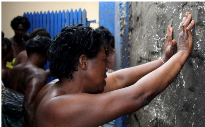
Figure 1.7. Vodú devotee in a contemplative pose soliloquizing and making her final supplications to the Kli-Adzima divinities on the finished ballili mural. All the devotees who have participated in plastering the shrine walls engage in meditative prayers and make their final supplications to the divinities before leaving the shrine (2016). Klikor, Volta Region