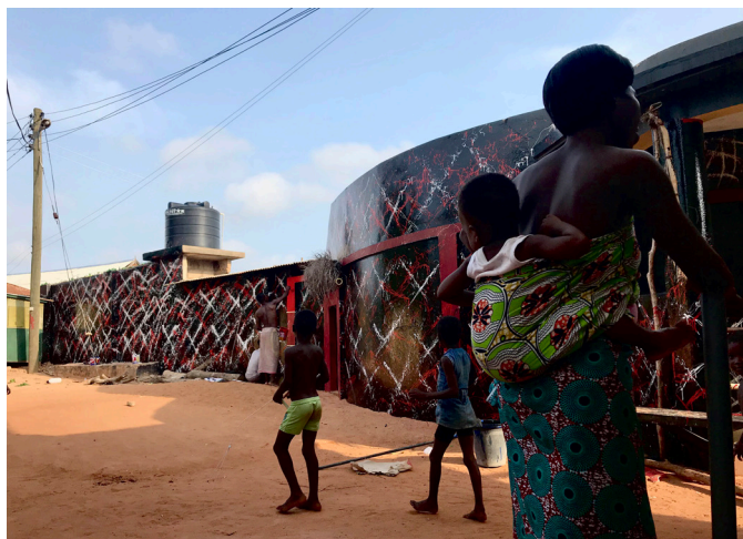
← Figure 2.1. Left: author painting the shrine walls of Torgbui Adzima ahead of the 2019 Kli-Adzima Spiritual Renewal Festival. Right: research assistants putting the finishing touches to the mural on the Torgbui Adzima shrine walls (2019). Klikor, Volta Region