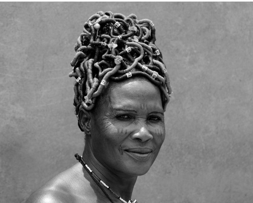
Figure 2.7. Kli-Adzima devotee adorned with yibotsi hairstyle (2016). Klikor, Volta Region

Finding verbal means to express the secret and hidden meanings of Vodou art has proven difficult. Phrases such as ‘ wo medé’a Vodou gome fia ame o’ and ‘ hutor mēFoa enu tso Vodou ntsi fuu o’ translate as ‘we don’t reveal all the “hidden meanings” of Vodou art’ and ‘Vodou priests don’t “speak too much” about Vodou art.’ Such positions are markedly different from other examples that arose in the course of my study of Ewe aesthetics, as when I was introduced to the notion of atsyɔkoe . A Vodou devotee spotted in an elaborate yibotsi or atsifwifwi hairstyle will simply respond, ‘ de ko me koe wo atsyɔkoe, ’ which translates as ‘this is merely meant for heightening my overall aesthetic effect, that’s all.’ Atsyɔkoe can thus loosely be translated as ‘aesthetics for aesthetics’ sake.’