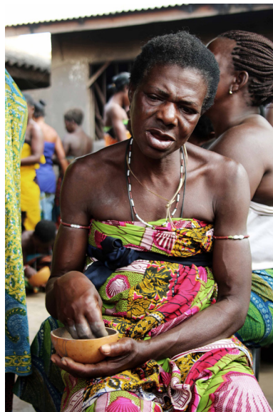
Figure 1.4. Kli-Adzima devotees pulverizing sacred kaolin , mixed with sacred water, into a fine paste while waiting for their turns to plaster the shrine walls. The sticky kaolin paste is used to plaster the shrine walls as a part of annual spiritual renewal rituals in the Kli-Adzima cluster of shrines during the festival period. It is common to observe the devotees saying prayers and soliloquizing while pulverizing and mixing the sacred kaolin with water (2016). Klikor, Volta Region