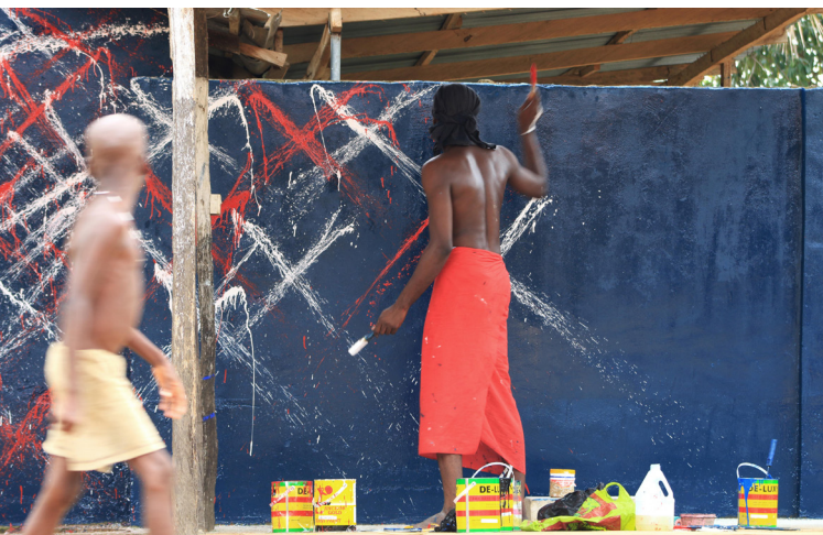
Figure 1.2. Researcher painting on the wall of an Adzima shrine in Torgodo, Volta Region. This is a variation of one of many abstract painting techniques within Vodun shrines, which involves dripping, soak-staining, smudging, sprinkling, stenciling, dabbing, splattering, splashing, and the smearing of mud, oil, blood, alcohol, paint, or other water-based solutions (2017)

It is necessary to emphasize that abstract painting has been practiced for generations in Ghana. There has been very little documentation of the abstract painting that is so prevalent in Ghana, particularly in the southern and northern regions.