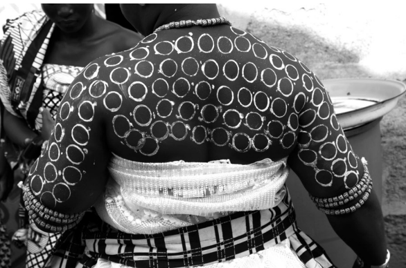
↓ Figure 2.3. Right: repetitive circles incorporated into the body art of a Vodun performer during the Kli-Adzima Spiritual Renewal Festival (2016). Mama Vena shrine, Klikor, Volta Region (courtesy of the author). Left: Young Ewe performance artists, Alakple and Klikor respectively (2017) (courtesy of the author)