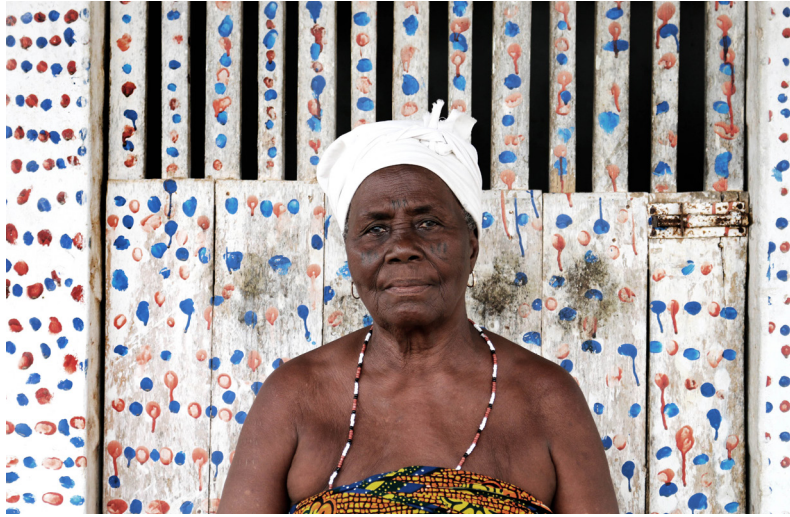
← Figure 2.4. Close-up shot of an Amegashie (spirit medium) sitting in front of her spot-painted shrine (2017). Tsabashi Dorkenu shrine, Afiadenyigba, Volta Region