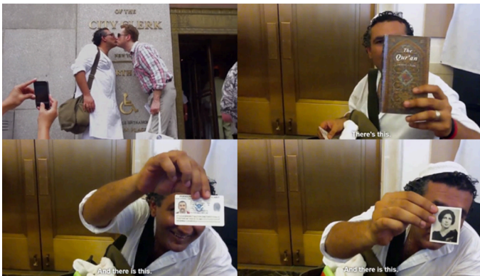
Figure 2. Framing belonging and domesticity in A Sinner in Mecca (2015)