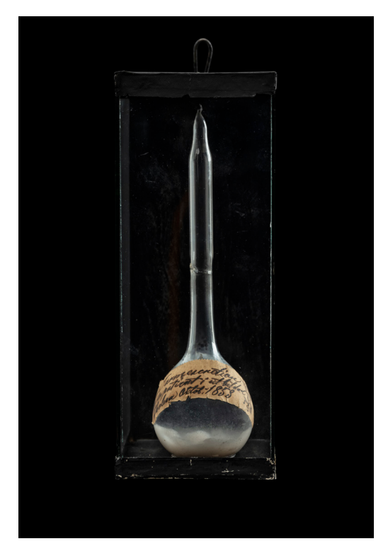
Figure 1. A photo of a sealed bottle of liquid cholera excrement from 1853 (from the exhibition Capturing Epidemics ). The single object connects a visceral sense of a particular person's sickness with large scale medical, historical, and scientific knowledge of epidemics

combination of the two—general and particular—that museum research can make available. The bottle and its contents evoke a powerfully visceral sense of coming close to a particular sick person, almost feeling it within our own body. But not on its own or without background: the resonances of those feelings are amplified by the larger-scale historical and medical knowledge. The particularity of feeling-it-in-our-stomach while comprehending broader medical and historical understandings, and of simultaneously juxtaposing multiple related contextualizations, is where our museum method derives a substantial part of its power (Ginzburg 1980, 1979).