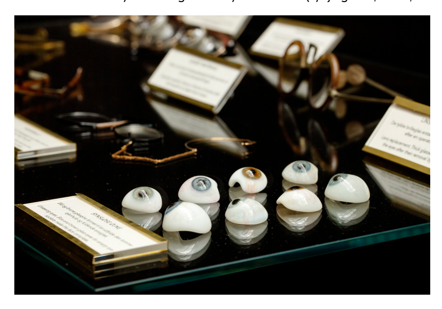
Figure 2. A photo of objects from across different parts of the collections at Medical Museion gathered in a new combination to show the aesthetics of the repaired body (from the exhibition Kintsugi - Golden Body Reparations).

repaired using lacquer and gold dust, became a metaphor that created a new collection. The idea emerged between the museum and a research centre for healthy aging, show-casing different object categories that reveal traces of repair in our bodies: pacemakers, glass eyes, golden teeth, hearing aids, and even the traces left in a fractured bone. For another exhibition, The Body Collected (2015), the external probe was a pronounced public interest in seeing preserved body parts from historical pathological collections. Combined with an ambition to make modern biomedicine more tangible, it resulted in collection-led research and exhibition concept. Ordering the collections according to a simple physical principle—the 'scale' of specimens from whole bodies, organs, tissue to genes—allowed the historical collections and biobank samples to mirror and make sense of each other leading to a new way of looking at history of medicine (Tybierg 2015, 2019b, forthcoming).