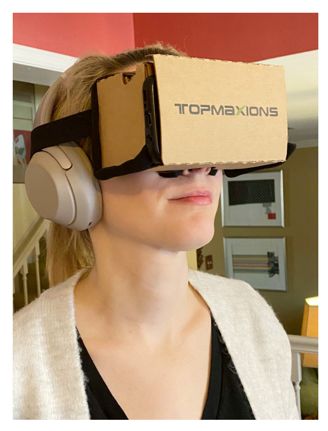
Figure 11. Photo of cardboard VR headset.

The VR Baptizo/Cineorama invokes the meaning of 'enchantment' in a magical sense by reanimating our relationship with our technological devices. While our phones can immediately show us photos and videos of the Baptistry, Baptizo's embodied experience brings surprise and delight to the viewer's sudden shift from their domestic environment to Florence. The slight blurriness from weak WiFi and the low-quality plastic lenses do not diminish the jolt of our plunge into immersion and the disorienting loss of real space. Moving images encircle the spectator at every turn of the head, and noise-cancelling headphones intensify the vibration of the bass as well as ambulatory noises; the cough or footstep of a tourist are so distinct they appear to emanate from real space. Along with the non-linear narrative of the film and its dissonant cuts and edits, the sensation of unexpectedness heightens the viewer's aesthetic engagement with the work.