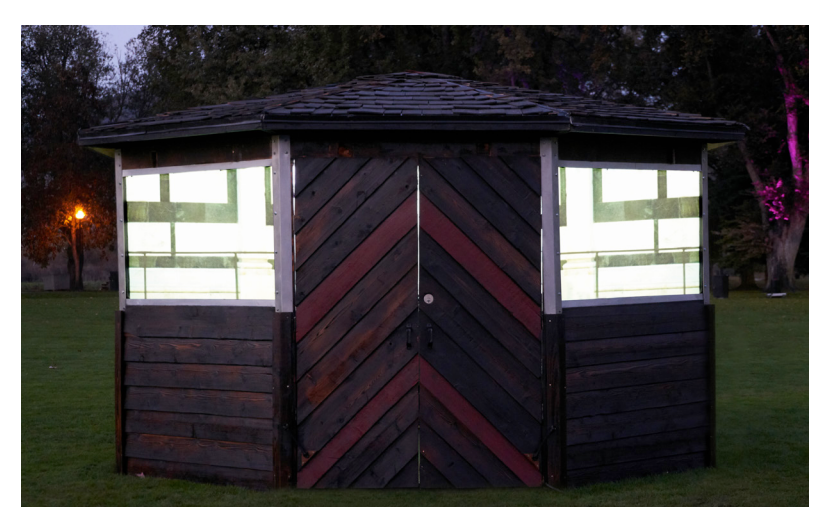
Figure 9. Cineorama's doors.

seamlessly blends the haptic allure of the work's handmade elements with the sleek design of new technologies in the ceiling, the white eight-camera device built by the artist nestled within a symmetrical web of wooden beams (Figure 10).