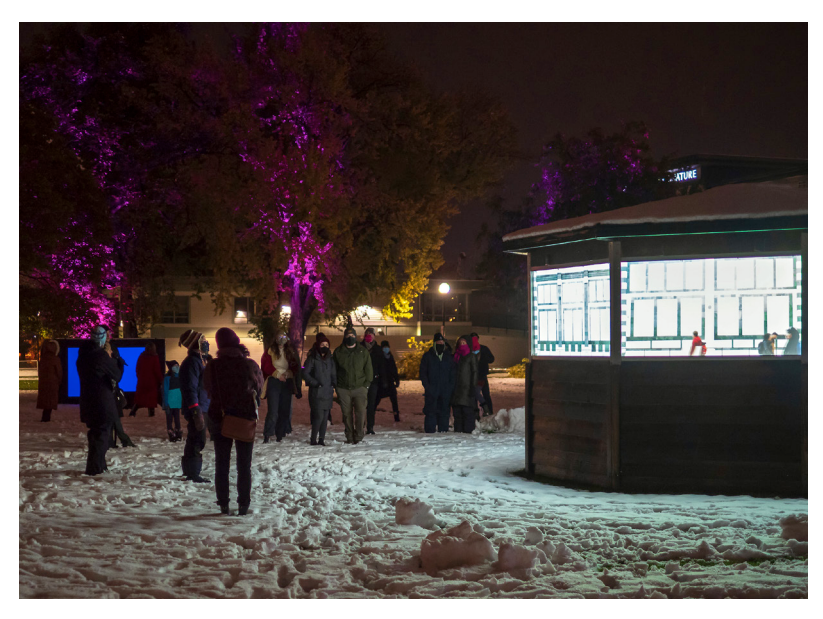
Figure 6. Visitors to Cineorama at Luminocity (courtesy of Frank Luca, 2020).

Indeed, with the outside offering a tantalizing peek at the experience within, Cineorama achieved the status of a fairground ride or attraction. As the only installation with restricted entry between the hours of 6 p.m. and 10 p.m., it was open to two people or one social group at a time in accordance with COVID-19 social distancing rules, and visitors often queued to await their turn (Figure 6)—an especially cold experience after it snowed. More broadly, Luminocity's sprawling outdoor space recalls late nineteenth- and early twentieth-century sites such as amusement parks, fun fairs, circuses, and World's Fairs. The layout encouraged carnivalesque wandering through Riverside Park, supported by a map and walking guide found at an information kiosk located outside Cineorama .