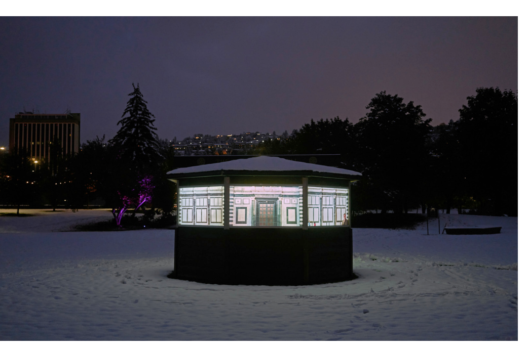
Figure 1. Photo of Levi Glass's Cineorama at Luminocity.