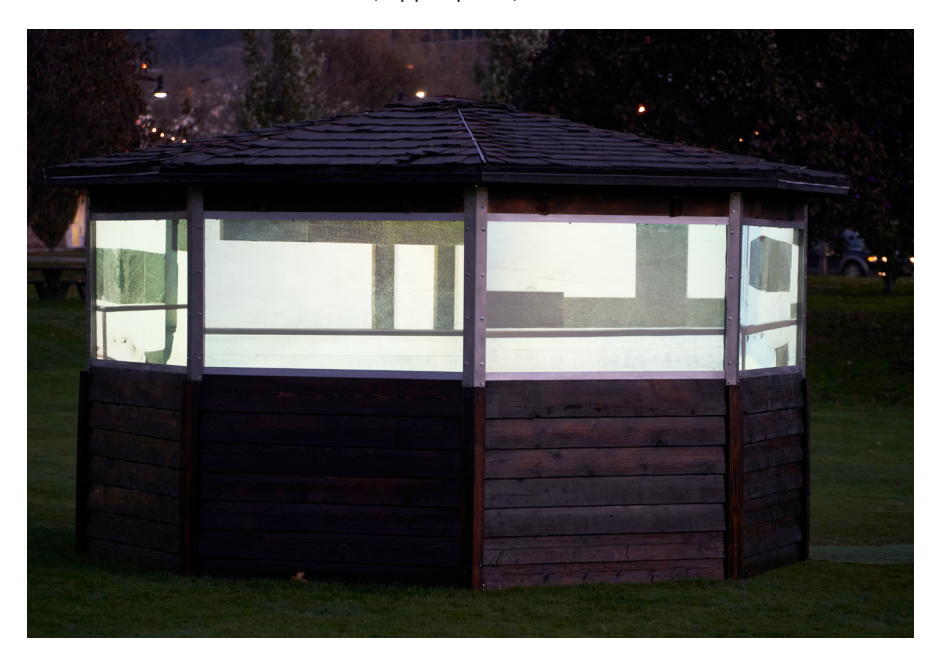
Figure 3. Exterior view of the abstract sequence in Baptizo.

stand, and railings, especially as several cameras begin to zoom out. At 7:19, Baptizo comes full circle: all eight cameras zoom in once more before zooming out to form the inverted façade again. Ten seconds later, they rise above the lower section of the building in a vertical tilt, losing the crowd, and glide up the arcade of arches, upper panel, and lantern into darkness.