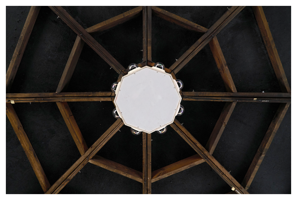
Figure 10. Cineorama's ceiling (courtesy of Levi Glass, 2020).