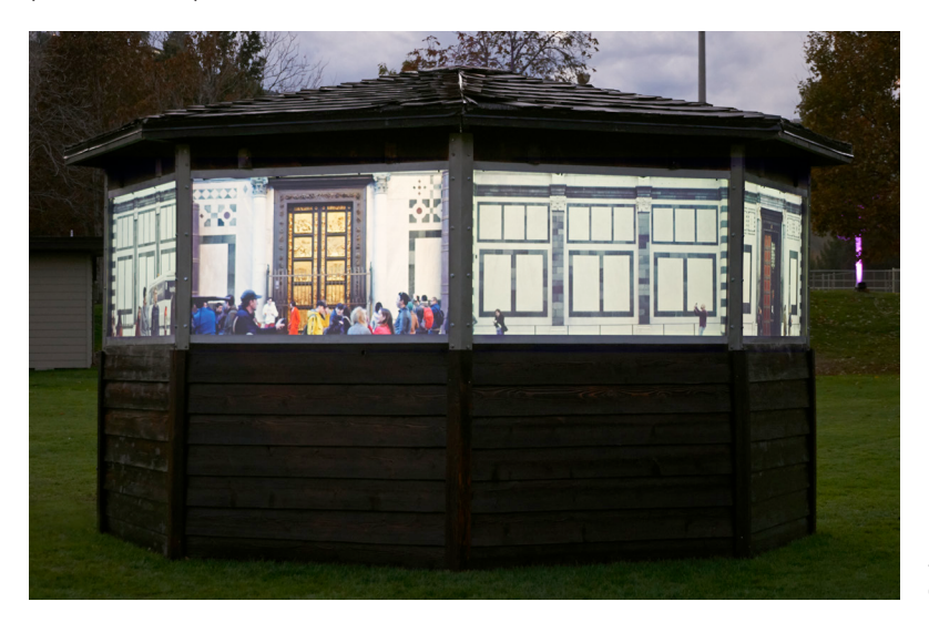
Figure 7. Cineorama's miniaturized Baptistry façade.

The surprise of having a multisensory tourist encounter with the Baptistry in Florence during the pandemic added to Baptizo/Cineorama's allure and novelty. The highly adaptive format of the Cineorama, which can be broken down, flat-packed, and re-installed anywhere with relative ease, demonstrates the same kind of mobility and wonder as the traveling panorama tradition. The nineteenth century saw immersive, touring panoramic structures (Trumpener and Barringer 2020: 13) as well as moving panoramas, which were 'ephemeral small-scale attractions' (Huhtamo 2013: 10) that could be set up in local theatres, community halls, or churches. Just as nineteenth-century spectators could experience painted views of far-off cities and landscapes in such displays, viewers at Luminocity could marvel at witnessing the sights and sounds of a bustling European city amid the riverside landscape of Kamloops. Given the closure of Canada's borders during the pandemic, Baptizo/Cineorama temporarily restored the recently lost pleasure of global travel: two visitors remarked with delight that 'it feels like we're traveling,' while others reminisced about previous trips abroad (Glass 2020c, personal communication<sup>8</sup>). The feeling of pleasure and nostalgia arising from unexpectedly being 'transported' to the site of a faraway place or a memory encapsulates film's ability 'to render affects and, in turn to affect' (Bruno 2007: 7).