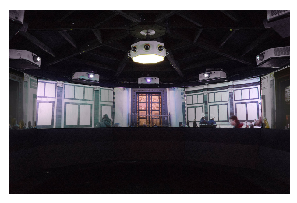
Figure 2. Aligned view of the Baptistry façade in Baptizo.