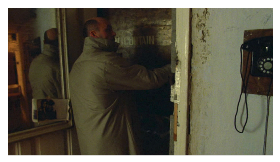
Figure 7. The Iron Curtain temporarily stops Krymov from entering Bananan's room. Screenshot of Sergey Solovyov, Assa (1987), DVD Extralucid Films 2021.

Conserve, Show, Restage, Revivify. The Film as (Trans)portable and Projectable Museum