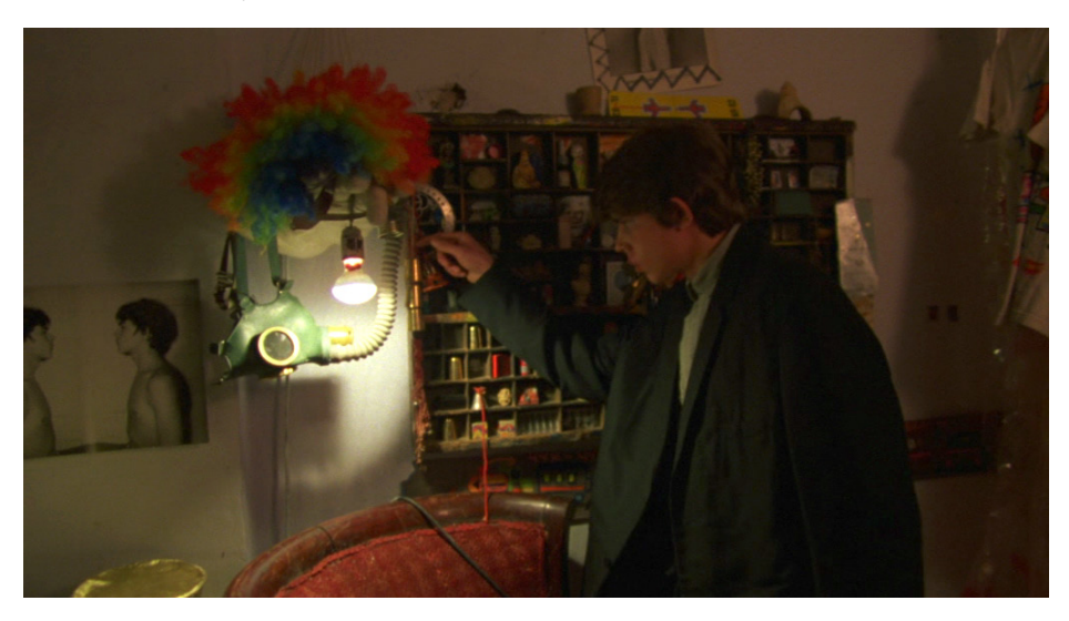
Figure 1. Bugayev visiting his own room. Screenshot of Sergey Solovyov, Assa (1987), DVD Extralucid Films 2021.

There are three different modalities in which Bananan's room is shown in the film. The first one is that of the 'guided tour,' a traditional stylistic exercise in a museum (on the 'guided tour' in cinema, see Lavin 2013). There are two of those in the film. The second one, made by Bananan himself when he comes back to his room after being beaten up, shows in a quite obvious way the director's desire to make the spectator 'visit' this space as a museum visitor, since Bananan, being the lodger and the owner of this room, is not very likely to explore and to discover different items. Still, this is what he does, and the camera lingers on his hands touching and moving around different art objects in the room.