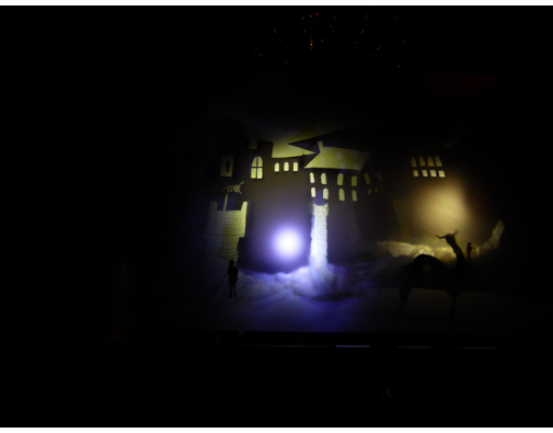
Figure 8. A scene from the Spatialized Myths shadow play showing Şahinbey and Karayılan (Blacksnake) in the underworld. © Aslıhan Şenel, Ece Yetim, all rights reserved, published with permission.