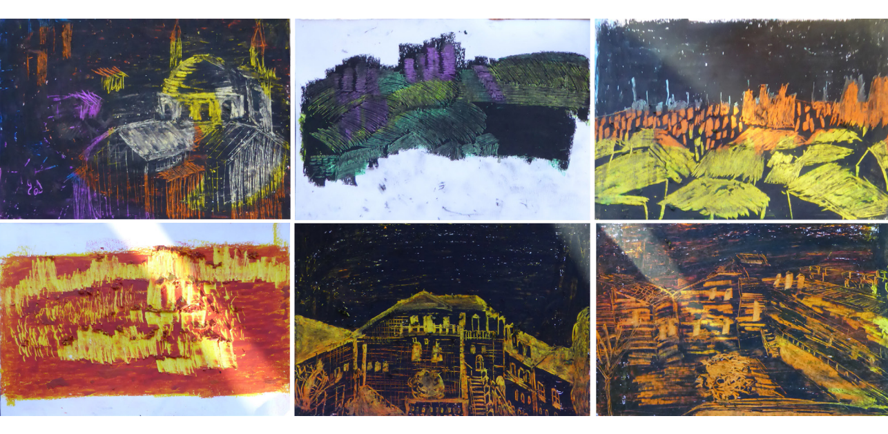
Figure 5. Scratchboard drawings showing views of the city of Gaziantep from the terrace of the Center for Gaziantep Research. © The workshop participants, all rights reserved, used with permission.

In addition to the drawings' techniques, their locations are important for understanding the city and its past and present myths, which are employed to silence multiple cultures, ethnicities, genders, and spatialities. The Roman cistern where we did the charcoal drawing is