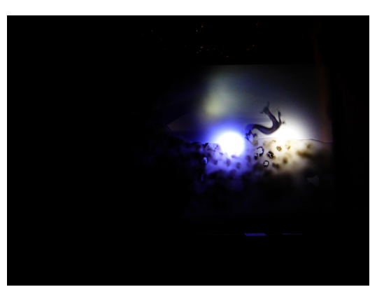
Figure 14. A scene from the Spatialized Myths shadow play showing Oceanus' anger and the clouds covering the city of Gaziantep. © Aslıhan Şenel, Ece Yetim, all rights reserved, published with permission.