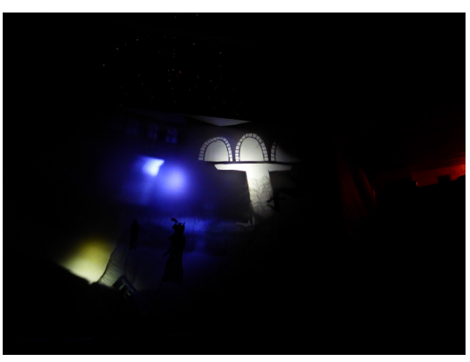
Figure 12. A scene from the Spatialized Myths shadow play showing Şahinbey asking for help from Cilali Çengi (Glossy Dancer).