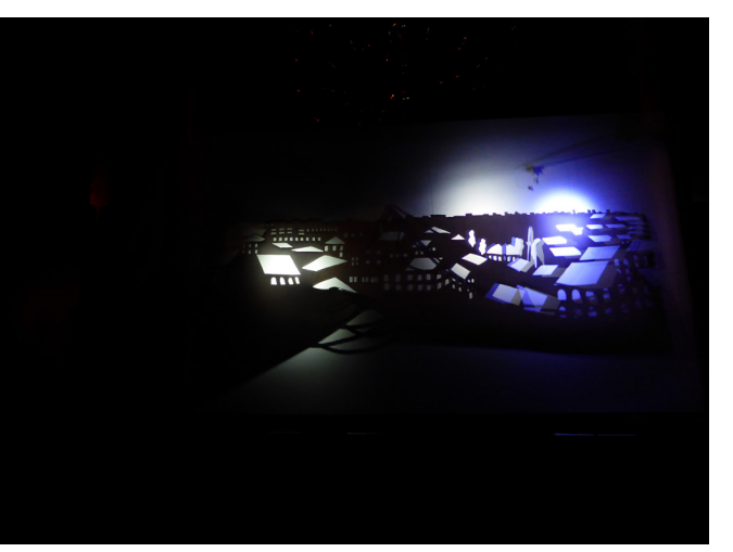
Figure 2. Performers seen behind the scene during the shadow play.