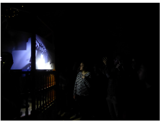
Figure 16. Audience watching the Spatialized Myths shadow play.