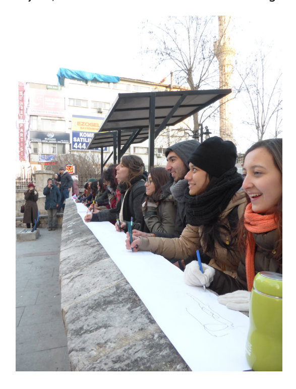
Figure 4. Collective blind contour drawing practice at Suburcu Street.