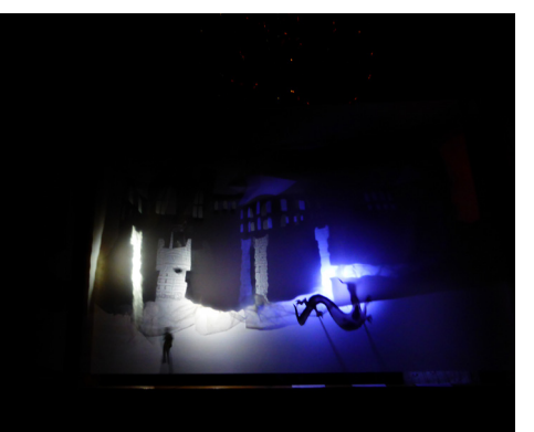
Figure 9. A scene from the Spatialized Myths shadow play showing Şahinbey talking to Tethys, Titan of rivers.