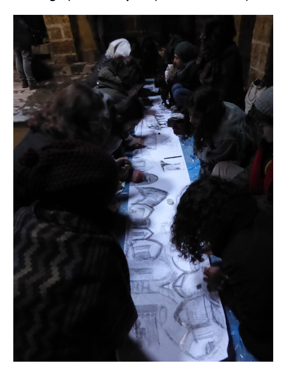
Figure 3. Collective charcoal drawing practice at Pişirici Kasteli.