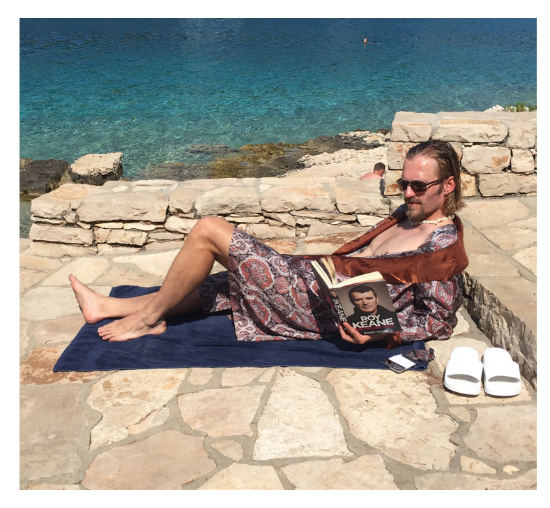
Figure 4. Russell Bruns/'Shane Malone,' Recharging with Roy Keane (2018) (courtesy of the artist)