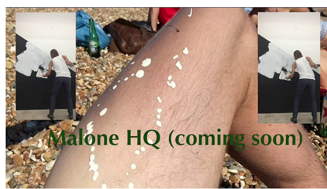
3. A Uniform Glow