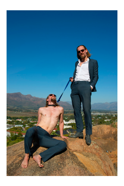
Figure 1. Russell Bruns/'Shane Malone,' Happy Mother's Day (2020)