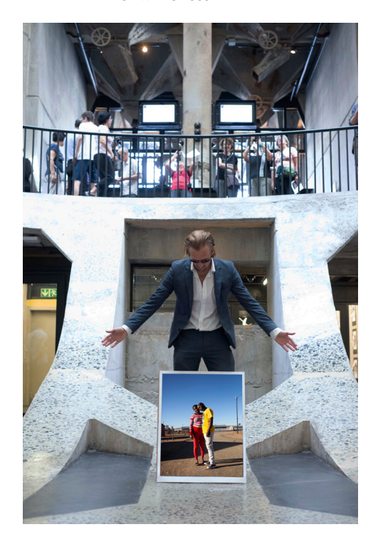
Figure 3. Russell Bruns/'Shane Malone,' Art (2018) (courtesy of Russell Bruns)

paradox of whiteness; its transcendent principle, its hocked reality. Above all, Bruns asks us to consider a different condition for the indifferent existence of whiteness.