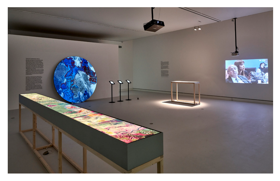
Figure 1. Exhibition view of Enter the Void, Kunsthalle Mainz (Hall II), with works by Forensic Architecture (from right to left): Ape Law (2016), CCN (2019), Ecocide in Indonesia (2016–17).

of spectator reception in relation to the space of the artwork, while allowing to sketch a theory on how to exhibit moving images based on the reciprocal interferences between its inner space and the exhibition space surrounding it.