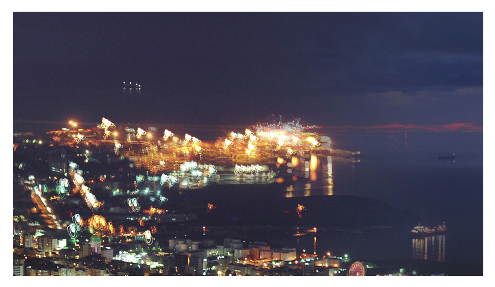
Figure 3. Joana Hadjithomas and Khalil Joreige, Waiting for the Barbarians (2013).

The subjects of representation in Remember the Light and Waiting for the Barbarians remain quite static because the works focus the study of light and color on an almost two-dimensional surface. As a result, the viewer's attention is catalyzed towards a focal point within the fields of representation. Because of these formal qualities of the pictures and of the lack of a plotoriented narrative, they manifest a centripetal type of framing. The space and time of the artwork remain separated from those of the spectator. On the one hand, the centripetal framing creates a discontinuity between the physical space occupied by the viewer and the space of the artwork; on the other, the absence of a plot means that viewers' reception process need not adapt to the duration of the moving image. These kinds of moving images are suited for conventional presentation on a museum's wall. This was the case with Waiting for the Barbarians' presentation at documenta 14 (2017), where the digital video appeared on a screen on a wall. Remember the Light usually features on screens hung in the middle of a semi-dark room, where viewers' ability to walk past them meant that the cinematic illusion of the black box was blended with the multi-screen installation's nature as an artistic environment.