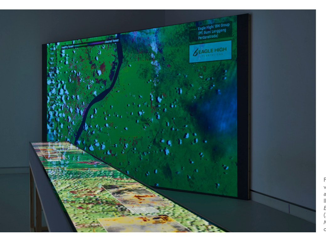
Figure 5. Exhibition view of Enter the Void at Kunsthalle Mainz (Hall II). Forensic Architecture's Ecocide in Indonesia (2016–17).