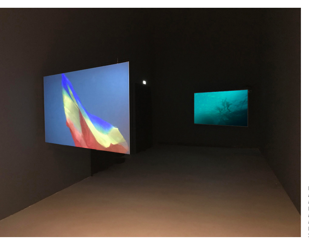
Figure 2. Joana Hadjithomas and Khalil Joreige, Remember the Light (2016). Exhibition view at Home Beirut: Sounding the Neighbours , Maxxi, Rome, Italy.

photographs of artworks, graphics, and on-screen texts, in addition to Godard's own footage starring the artist himself. This postmodern pastiche of film classics and canonic artworks allows Godard not only to retrace the history of film as integral to the history of art, but also to stress its medium-specific idiom based on montage. Further, the visual overlapping of the moving image with graphics and texts recalls a Cubist collage in which high art merges with visuals commonly associated with popular culture. Histoire(s) du cinema is truly a film about the history of cinema as history of art.